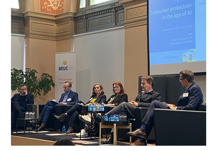
European Consumer Organisation (BEUC) Conference: Rethinking Consumer Protection in the Digital World.

EU Commissioner for Competition Margrethe Vestager delivered important remarks on the EU AI Act: "By moving early to set the ground rules for how AI can be used, in particular for 'high-risk' applications, we have a window of opportunity. We can shape how